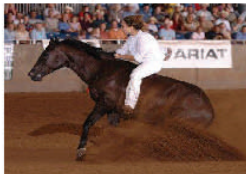
2006 Road to the Horse Winner